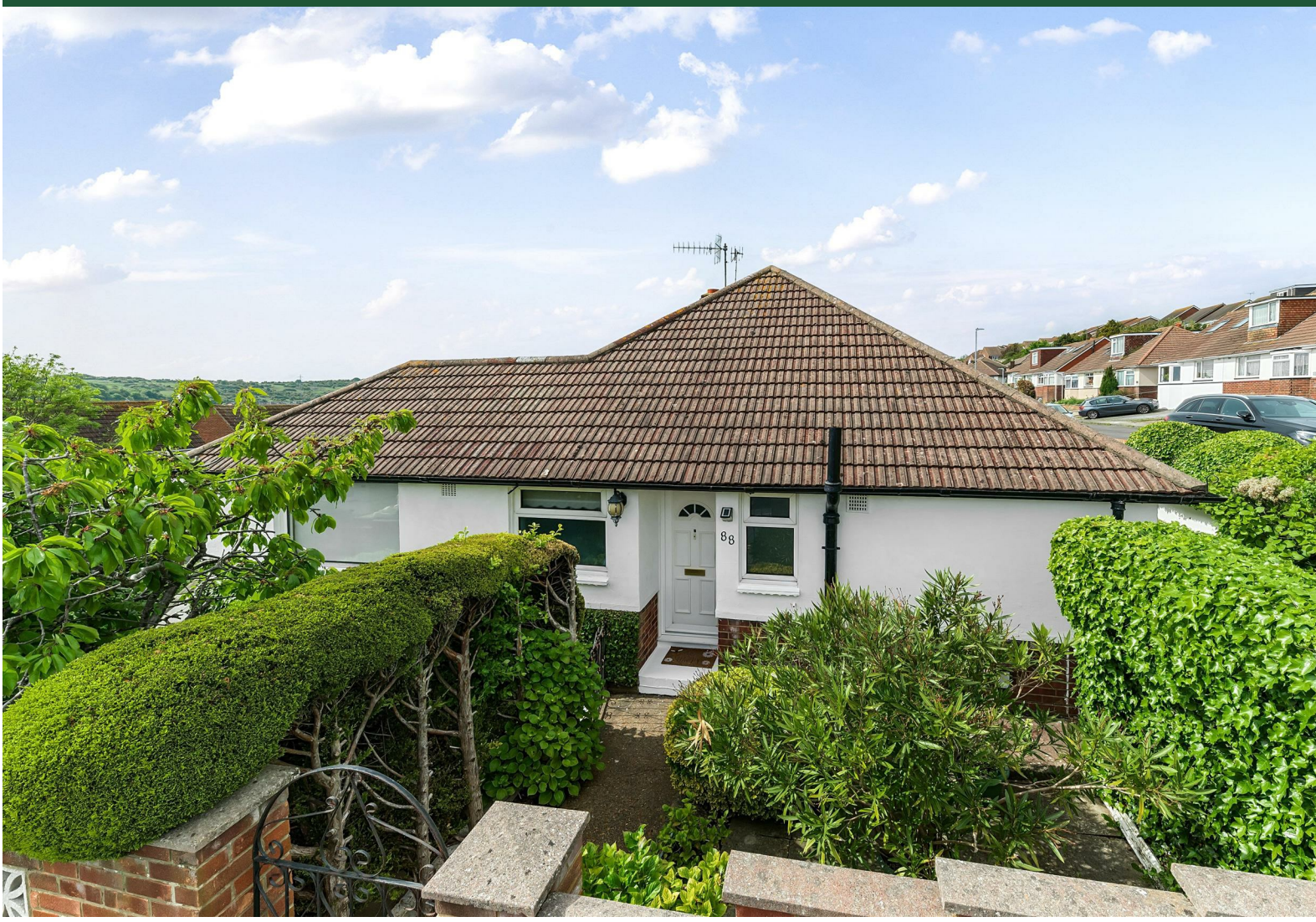
North Lane, Portslade, East Sussex BN41 2HG Price £325,000 Freehold